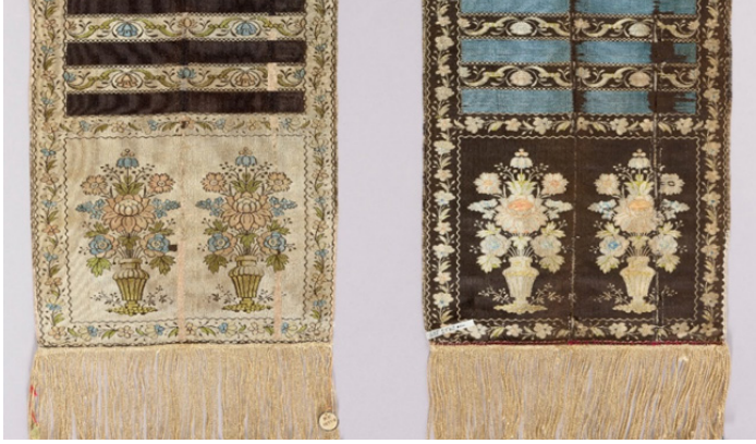
Рис. 11 Kuntush belt with «Bouquet» ornament, unknown author, second half of the 18th century.

The definition of «bouquet» in relation to the belts' main composition is rather arbitrary. It is based on the similarity of two floral images which were constructed with a clear vertical axis of symmetry – it could be interpreted as a stem or sprout growing from a cut tree or the ground [4, ст. 109-110].