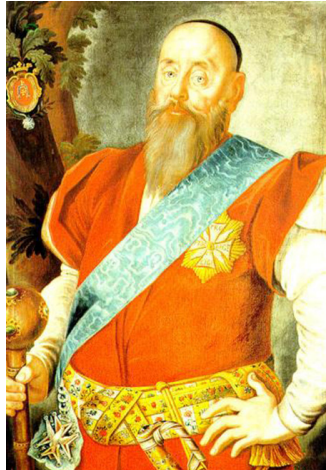
Рис. 1. Vaclav Revusky in a suit with a belt 18th century.

traditions. So it is no wonder that the belt, like the kuntush, became a symbol of the nobility's national attire – the so-called Sarmatian fashion which combined elements of Eastern and European costume and formed a specific visual code of the Polish Lithuanian Commonwealth (рис. 1-2).