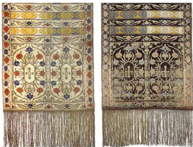
Рис. 10. Belt with ends' ornamental elements of the "wreath-medallion type", with the image of carnations. Slutsk Radziwill Manufactory. 1767–1780. Collection of the National Museum of Lithuania (Vilnius).

According to researchers, belts from the Slutsk manufactory with heads decorated in the form of flower bouquets (рис. 11) made up a significant part of the Persian production.