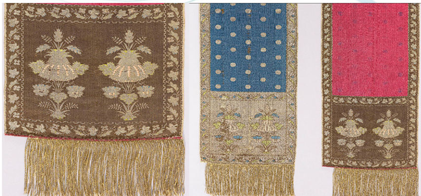
Рис. 9. Kuntush belt, double-sided. Unknown author, second half of the 18th century, National Museum in Warsaw.