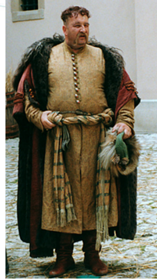
Рис. 13 Frames from Jerzy Hoffmann's film «With Fire and Sword», 1999.

In the visual arts the kuntush belt's ornaments inspire the creation of decorative paintings, tapestries and graphic compositions. Some artists interpret the belt as a metaphor for cultural continuity, so they combine traditional motifs with modern abstract techniques.