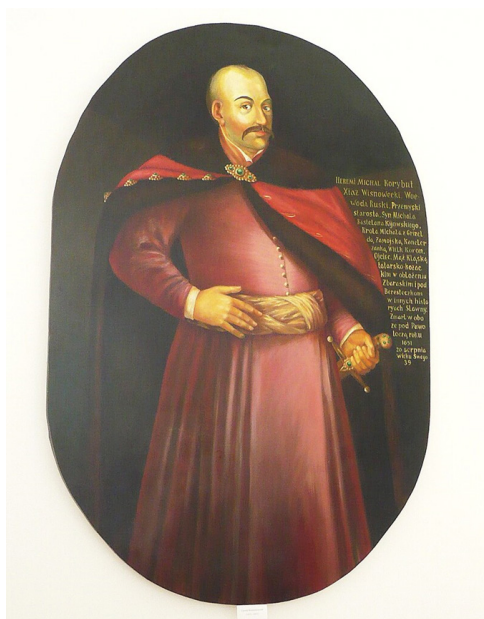
Рис. 3. Yarema Wyszniewiecki. Portrait by Tomasz Leśniowski in the Wyszniewiecki Palace 18th century.

Over time kuntush belt firmly took its place in the Ukrainian elite's costumes [13, с.129] and belt's simpler and cheaper versions were liked by Cossacks. With the beginning of the manufactories' development which produced this type of costume, belts became more accessible to a wider circle of connoisseurs. Kuntush belt can be seen in many images and full-length portraits of hetmans, foremen and ordinary Cossacks, for example, in the portrait of Yarema Vyshnevetsky (portrait by Tomasz Leśniowski in the Vyshniivts Palace) (рис. 3).