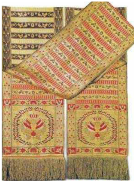
Рис. 4 A type of kuntush belt with heraldic symbols of the Polish Lithuanian Commonwealth 18th century.

Belts were woven on special looms or were brought from the East. They became an indicator of noble wealth and honour. Wearing an expensive belt was tantamount to demonstrating a coat of arms – a symbol of personal dignity. Thus, the kuntush belt gradually acquired a ritual significance in representative attire (рис. 4).