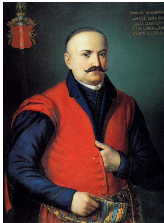
Рис. 2. Tadeusz Bogdanovich, portrait from 1891, by Wikenty Slendzinski.