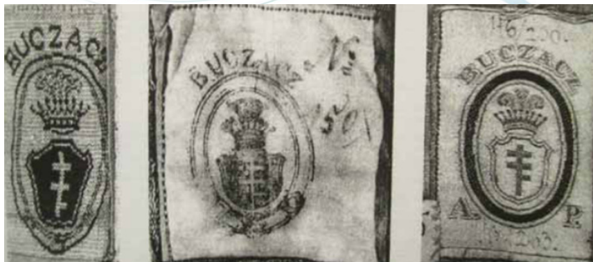
Рис. 5. Marks of Buchach kuntush belts based on materials from the MNW collection 18th century [10, cm. 132].

In Eastern Europe kuntush belts were developed in the form of separate local weaving schools. The most famous of them was the Slutsk Manufactory, it was founded in the middle of the 18th century. This factory products were distinguished by high quality, complexity of ornaments and richness of materials. They were exported throughout the Polish Lithuanian Commonwealth and even to Western Europe. The Slutsk silk belt manufactory annually produced goods worth up to 10 thousand zlotys [8, ст. 130].